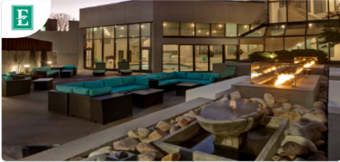
Embassy Suites by Hilton Oklahoma City Northwest 3233 NW Expressway Oklahoma City, Oklahoma 73112 USA